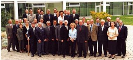
ACS meeting in 2001 in Mannheim, Germany