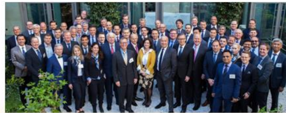
Globalscope conference in 2019 in Paris