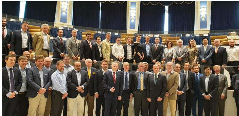
Georgia Conference - September 2018