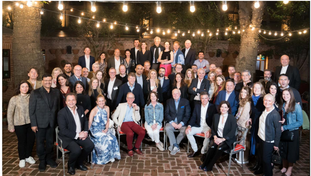
Globalscope Conference Buenos Aires April 2023