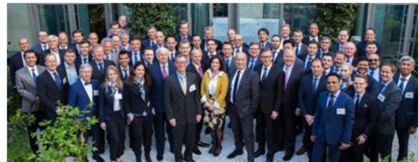
Globalscope conference in 2019 in Paris